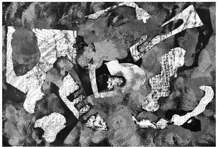
Leah Dawson Exploration in Shape and Texture, Painting Honorable Mention